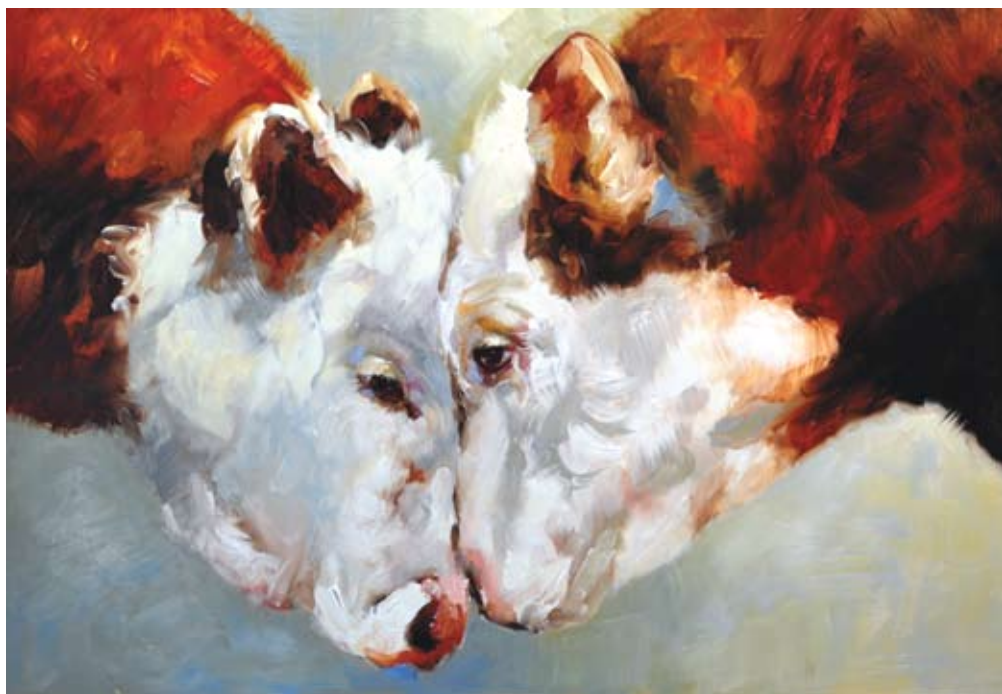
EYE TO EYE, OIL ON CANVAS, 24 X 36"